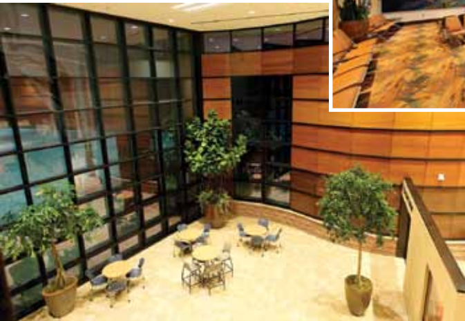
Interior of the new St. George Municipal Airport