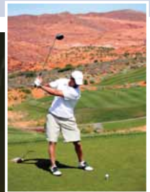
far left: St. George Municipal Airport left: Orderville Canyon above: The Ledges of St. George golf course

Even the arts benefit from St. George's colorful location. The Tuacahn outdoor amphitheater presents a lineup of top stars and big productions in a stunning setting. This year's concert series kicks off with Bill Cosby, March 11, and includes the Lettermen, Eddie Money, REO Speedwagon, Air Supply, Lonestar, Don McLean and Sinbad. June launches the theater season. Disney's The Little Mermaid and Grease alternate nightly into October with the exception of Sundays when the theater is dark. (That's just showbiz lingo. This stage is always lit by star shine.)