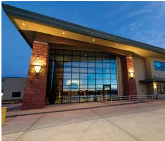
St. George Municipal Airport