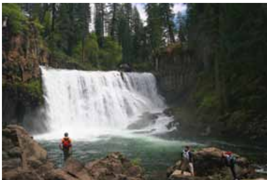
Brandy Creek Falls in Whiskeytown Recreational Area

Whiskeytown National Recreation Area , just eight miles west of Redding, offers 36 miles of shoreline and placid waters—the ideal setting for sailing, scuba diving and kayaking. Personal watercraft are prohibited and lifeguards patrol the popular Brandy Creek Beach in summer. Hiking, mountain biking, horseback riding and camping are other outdoor options for benefiting from the area's sunshine. (Only Yuma, Arizona boasts a higher percentage of sunny days per year.)