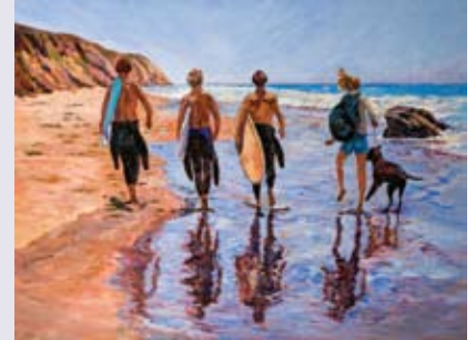
Let's Go Surfing, 36" x 48" oil on canvas