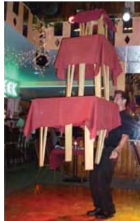
Traditional Greek table dance