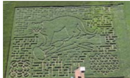
Aerial view of Heartland Country Corn Maze's mountain lion design

It's not necessary to wait until next summer to get a taste of rural South Dakota. Autumn in Sioux Falls holds other opportunities to feel close to the land. During the harvest season, anyone can get a tiny glimpse of the pioneer experience by heading south of town to pick apples or choose a fresh pumpkin at the Country Apple Orchard near Harrisburg. About five miles from there, the Heartland County Corn Maze is an opportunity to clamber through a dense field carved with paths that also form a work of art. This manner of fall fun is a far cry from cutting corn with a hand sickle or a team of horses. The tasks that meant survival for Laura and her family now provide pleasant pastimes for those who live much easier lives. Her tales of the faith, love and friendship that sustained the prairie pioneers still resonate in Sioux Falls. ■