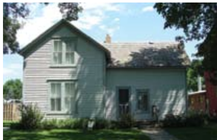
Homes on the Prairie: Author Laura Ingalls Wilder and her family spent their first Dakota winter in the structure shown at left; Later Charles "Pa" Ingalls built the house shown at right

the Town on the Prairie and reflected on her stint as a 15-year-old South Dakota schoolmarm smitten with the young farmer Almanzo Wilder in These Happy Golden Years .