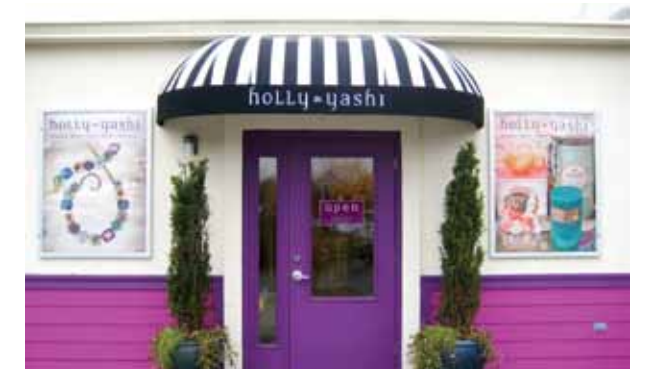
The Holly Yashi store in Arcata