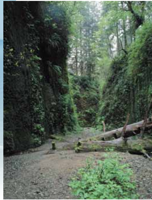
Fern Canyon near Arcata