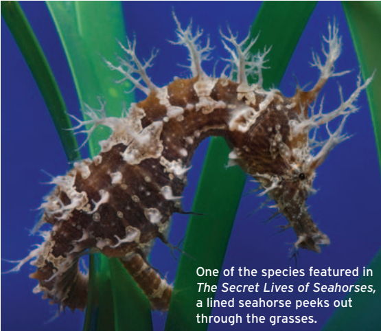
One of the species featured in The Secret Lives of Seahorses , a lined seahorse peeks out through the grasses.

Back in Hovden's heyday, this warehouse was among more than a dozen canneries processing a seemingly endless sea of sardines. By 1926, Monterey workers were scaling 70 tons of the fish each hour. Grainy black and white film footage salvaged from the company vault reveals weary-faced women, hairnets neatly in place, working assembly lines and processing a rapid parade of tins crammed full of the silvery fish. With a little imagination you can almost smell the stench.