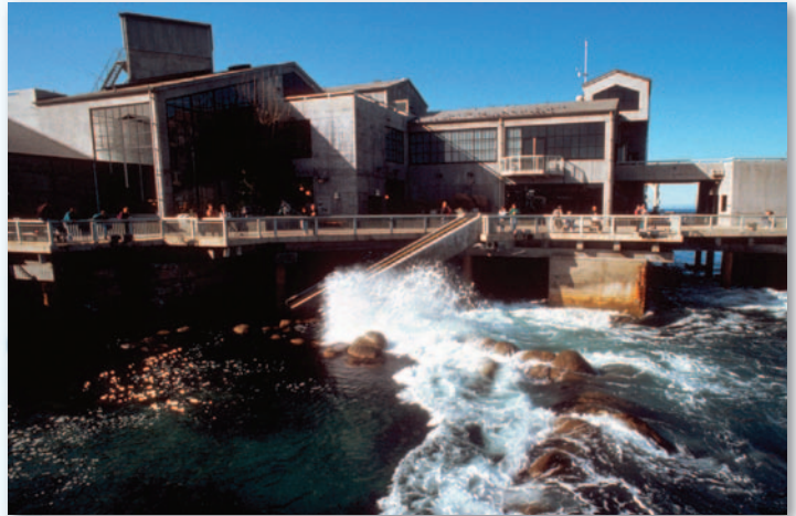
The Monterey Bay Aquarium

While an aquarium-centric getaway is an ideal way to spend a relaxing Monterey weekend, the surrounding area offers enough diversion for a week or even longer. The canneries occupied a very brief era in Monterey's long history. Among the state's first settlements it served as capital of Alta California under Spanish rule. History buffs enjoy exploring the old adobe downtown area. Families revel in the Monterey County Youth Museum on Washington. Just five miles south of town, the white sand beaches of quaint Carmel lure visitors, while Steinbeck's Salinas with its ag-tours and a museum devoted to the author is a half-hour drive to the northeast. Pebble Beach with its legendary golf course and awe-inspiring 17-mile drive through the Del Monte Forest is another Monterey must-see. ■