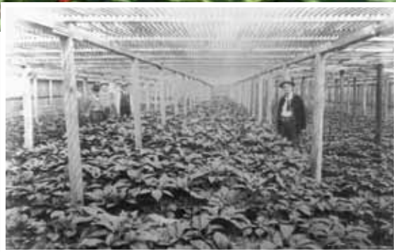
Inspecting a garden 1930