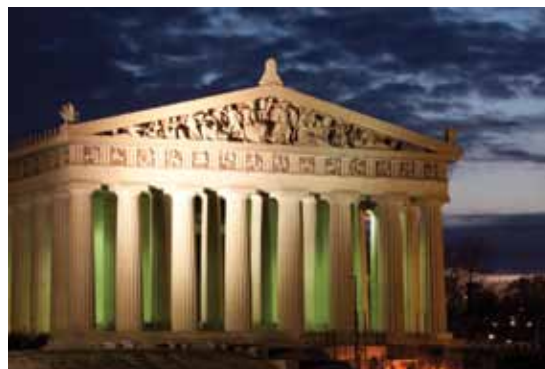
Nashville is home to a full-sized replica of the Parthenon.

Country Ham and Parsnip Pizza and Cornmeal Crusted Catfish with Celery Root Agro Dolce. Not your average Nashville meat-and-three kind of café.