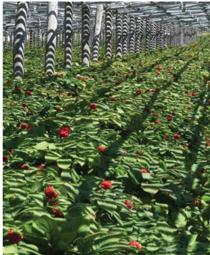
Ginseng garden at berry time

The farmland around Wausau does more than pasture cows and produce row crops. It also makes Marathon County a world-leader in production of the all-purpose herbal remedy ginseng. The primary market for the slow-growing root? China.