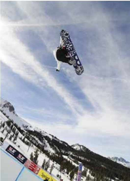
Shaun White at practice during the 2010 Halfpipe finals on Mammoth Mountain.