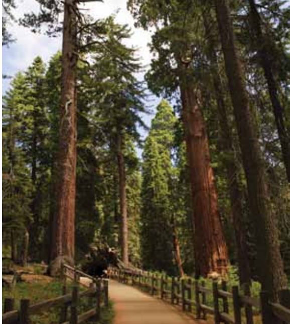
General Grant Grove in Kings Canyon National Park, near Mammoth

50 jumps. It also boasts three halfpipes, including the 22-foot-tall Super Duper Pipe. Mammoth Unbound's features range from beginner bumps and jibs in the Disco Park to the big, burly massive jump lines of the Main Park. If you've seen Mammoth on TV, this is what you were watching.