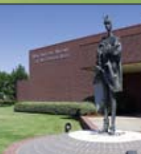
Ellen Noël Art Museum