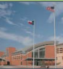
Midland International Airport